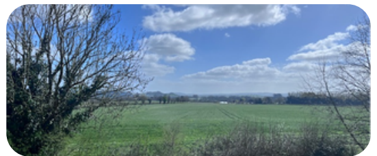
Beautiful Spring views from South Petherton Surgery

If you would like to find out more regarding the PPG, please let us know.